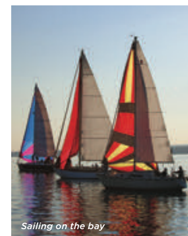
Sailing on the bay