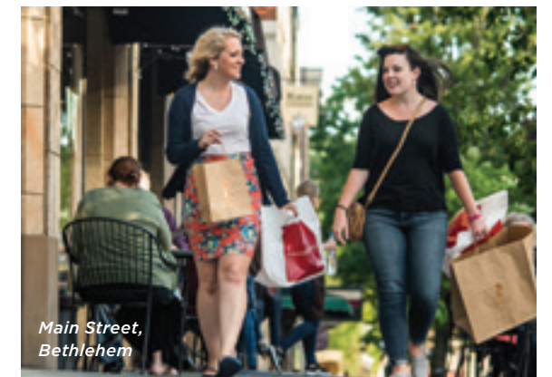
Main Street, Bethlehem

"We are reaching 40,000 people locally with our programs, and we're servicing 2,600 students in this community, which is classified as a low-income census tract.