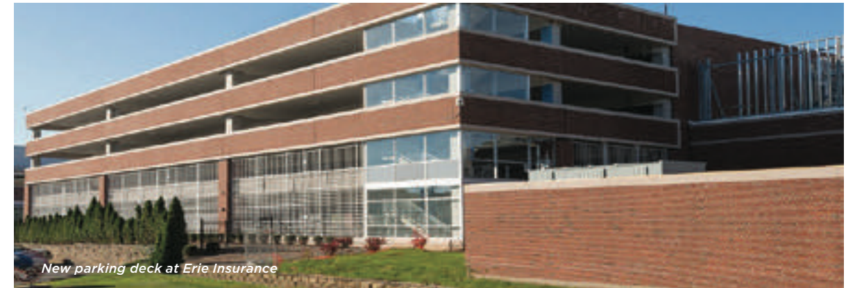
New parking deck at Erie Insurance

The company's real estate investments span nearly 40 acres in downtown Erie. Over the past several years, Erie Insurance has redeveloped the Erie Armory, the Heritage Center, and numerous historical properties. The company built the Technical Learning Center and a 1,000-space parking garage, and recently broke ground on a seven-story, LEED-certified office complex.