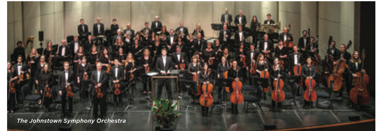
The Johnstown Symphony Orchestra

The September 11th National Memorial Trail links the memorial sites at the World Trade Center, Pentagon, and the Flight 93 National Monument, serving as a tribute to the men and women who perished on September 11, 2001. This 1,300-mile, multipurpose trail passes through Cambria County on its way to the Flight 93 Memorial, which will provide unique exposure to the city of Johnstown.