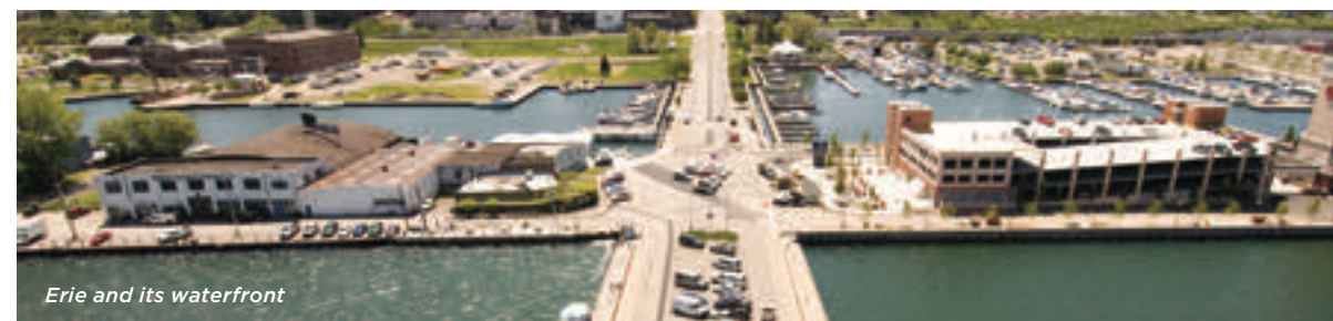
Erie and its waterfront