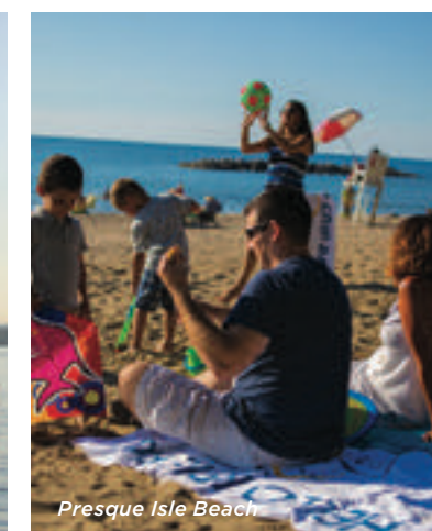
Presque Isle Beach