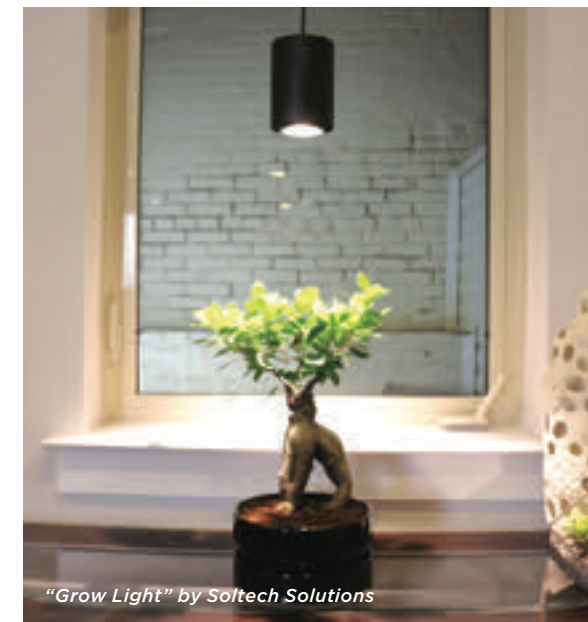
"Grow Light" by Soltech Solutions