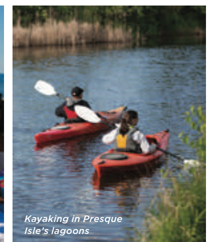
Kayaking in Presque Isle's lagoons