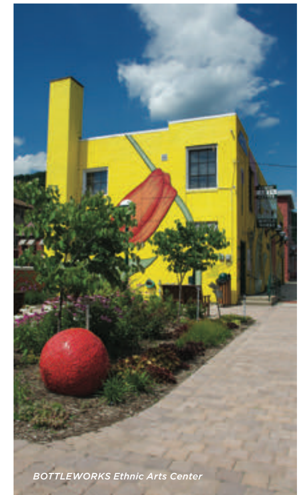
BOTTLEWORKS Ethnic Arts Center

As part of the Vision 2025 initiative's plans to grow the creative class, local leaders plan to open Creator Square, a living studio artisan residency and museum development in downtown Johnstown. This development will provide space for the growing artisan and maker population, while engaging community members with new and traditional crafts.