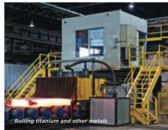
Rolling titanium and other metals

Since launching operations — which started the day after the mill was commissioned — the mill’s capabilities have garnered interest from customers around the world.