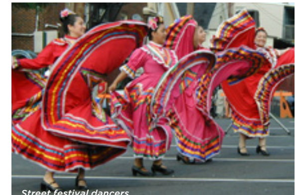
Street festival dancers